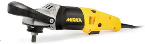
Mirka® PS1437 Polisher, 150 mm