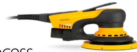
Mirka® DEROS II 650CV 150 mm, orbit 5 mm