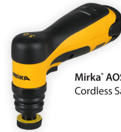
Mirka® AOS-B 130NV Cordless Sander, 32 mm